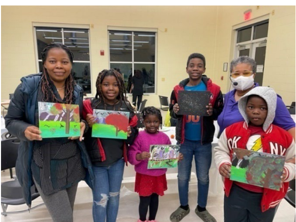
BUILDING RESILIENCY THROUGH ART