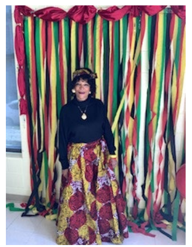
SENIOR CENTER @ CHARLES HOUSTON - BLACK HISTORY MONTH CELEBRATION