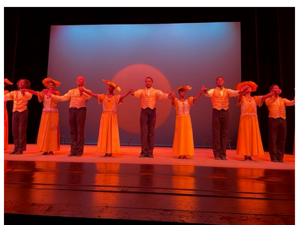
LINK STUDENTS ATTENDING ALVIN AILEY PERFORMANCE @ KENNEDY CENTER