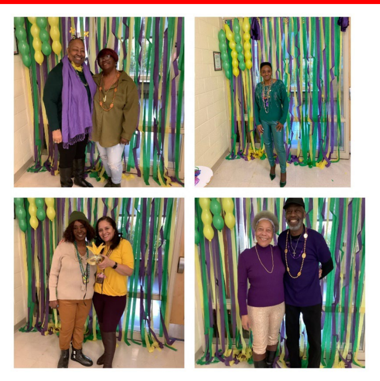
SENIOR CENTER @ CHARLES HOUSTON - MARDI GRAS CELEBRATION